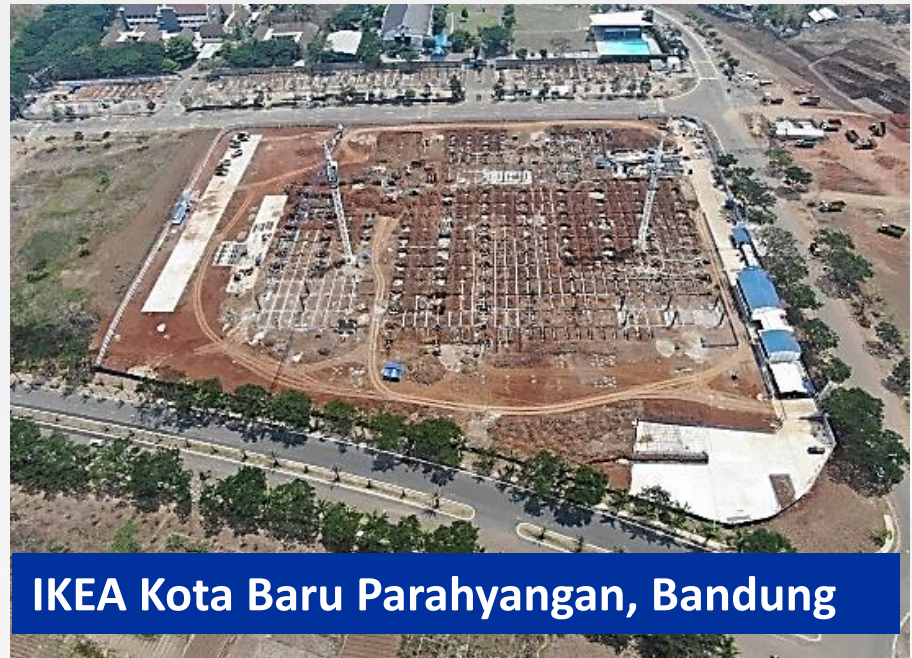
IKEA Kota Baru Parahyangan, Bandung