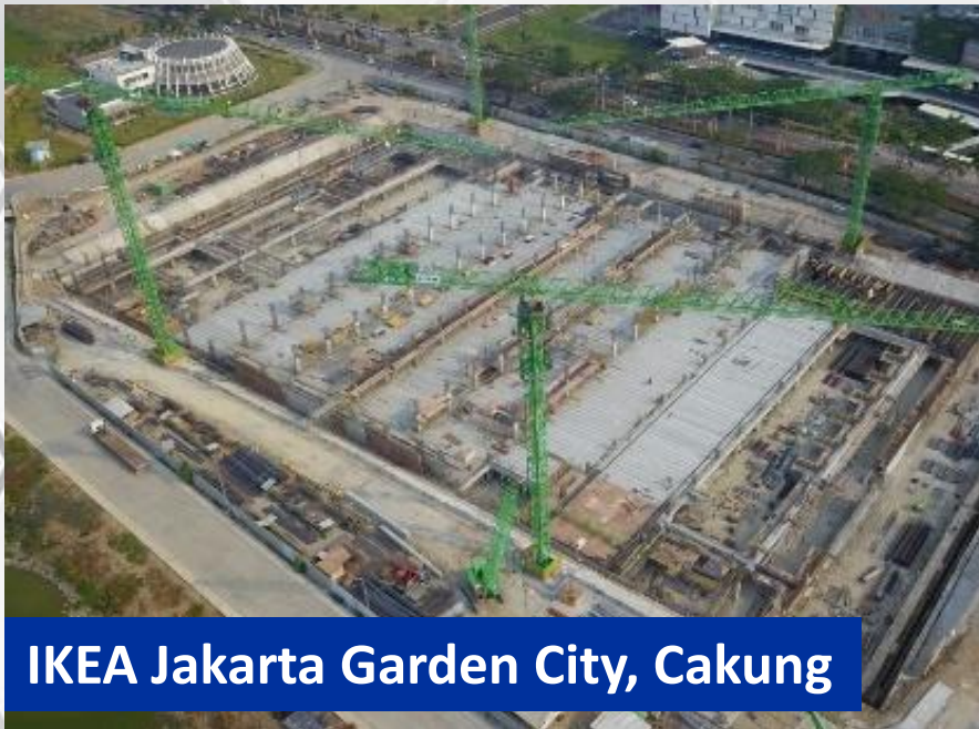
IKEA Jakarta Garden City, Cakung

Good progress for IKEA Cakung and Bandung constructions, planned to open at the end of 2020