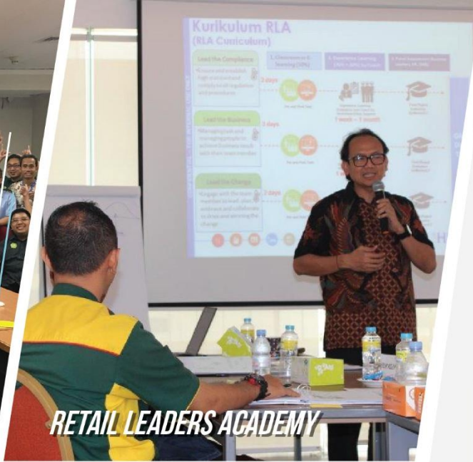
RETAIL LEADERS ACADEMY